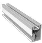
Art. 0109 Mounting Rail Measurements: 31x50 Length: 6200mm, 3100mm, 2070mm Joining screws top: M8 side: M8/M10/M12 Material: AL 6060T6